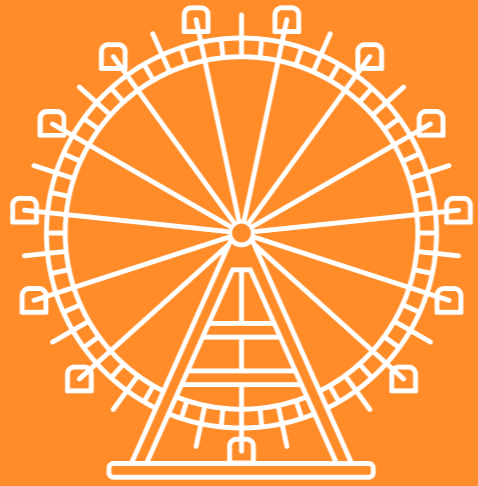
Place of work in Vienna, one of the world's most liveable cities